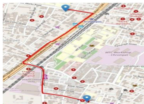
Figure 3: Visualization of store locations and transfer route generated for inventory redistribution.

B. Store Location and Transfer Route Visualization. To support efficient logistics planning, the system provides a geographic visualization of store locations and the potential transfer routes generated by the redistribution algorithm. Store coordinates are plotted on a digital map, and the optimal path between the surplus store and the deficit store is highlighted to represent the recommended inventory movement. Fig. 3 illustrates an example route between two retail locations within the same cluster.